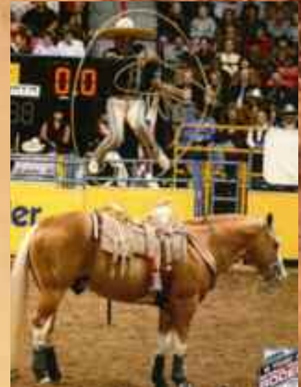
An Hispanic roping act.

The family-oriented rodeo event will feature the best PRCA athletes, top-quality rodeo stock and first-class production values with three performances from Fri-Sun. including unique arena entertainment between the action segments. During all performances, an emphasis will be placed on patriotic and family values. Special efforts will be aimed at incorporating Indian, Hispanic, military and underprivileged personnel, both in competition and in rodeo support roles.